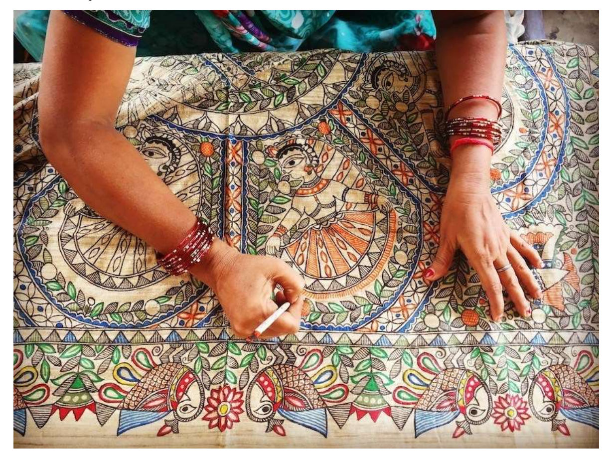
The artist making Madhubani Painting on Saree

range of dresses embellished with MadhubaniPaintings like stoles, sarees, dupattas, Kurtis, tops, and accessories like umbrellas, footwear, handbags, jewelry, watches are increasing in the market by storm.