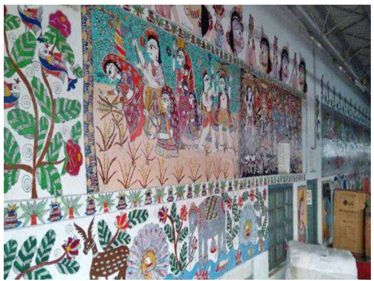
Others include scenes from Mahabharata and many rituals of popular festivals like Chhat Puja and simple rural and social life and folk dance.

Nowadays one can see this beautiful piece of art on clothes, walls of railways, trains, picture galleries, etc.